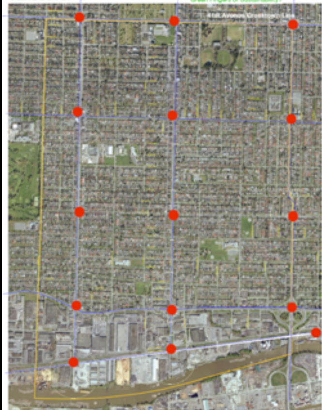
2. Nodes Defining Urban Villages/High Density, Mid rise. -also real neighbourhoods & small: 5000 pop.

Vancouver Community Planning • SSP Session Balfour & Associates • Strategic Planning 2006-10-04