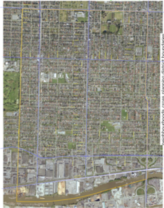
1. Arterials Defining Quiet Neighbourhoods -- and real neighbourhoods are small: 5000 pop.

Vancouver Community Planning - SSP Section Balfour & Associates - Strategic Planning 2008-10-04