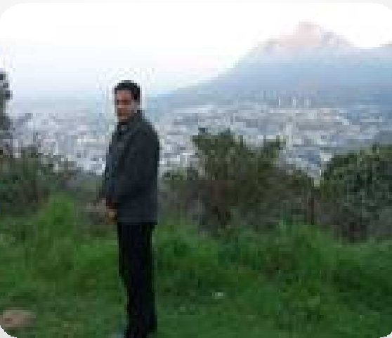
Cape Town (South Africa)